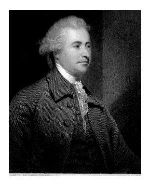
Edmund Burke After original by Joshua Reynolds

Burke soon made alliances with leading Whig politicians, and was attracted to reforming causes. He attacked the British government during the American Revolution and strongly criticised the administration of India for its corruption .