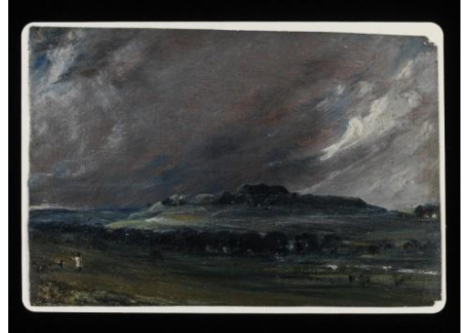
Old Sarum by John Constable

Today, Parliament tries to keep the number of voters in each constituency roughly equal, and every so often revises the boundaries of constituencies to reflect changes in population. Yet in the early nineteenth century, this did not happen. With the growth of new towns thanks to the Industrial Revolution , the places that had MPs and the places where people lived were now very different. The new towns of Manchester and <u>Birmingham</u> did not elect their own MPs, but there were many rotten boroughs that did. There was lots of opportunity for rich landowners to have more influence over who was in Parliament.