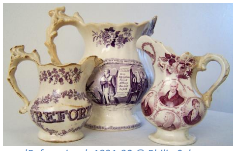
'Reform jugs', 1831-32

Earl Grey was an unlikely reformer. He was himself a wealthy landowner and many of those in his government were related to him. They all believed, however, that the system needed reform otherwise there was a risk that people would turn to violence to get their political rights. More disturbances, like that at ' Peterloo ' in Lancashire might follow.