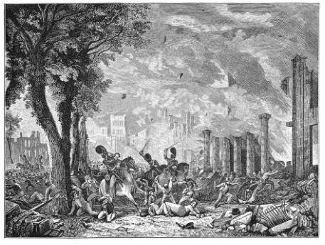
Rioters in Queen's Square, Bristol

In 1831 the House of Lords rejected the Reform Bill . This rejection led to rioting around the country. In Nottingham, the castle (home to the anti-reform Duke of Newcastle) was attacked.