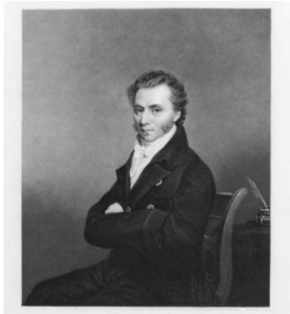
Thomas Attwood

Thomas Attwood was born in to a middle class Warwickshire manufacturing family. He joined the family bank and for much of his early years was conservative in his politics.