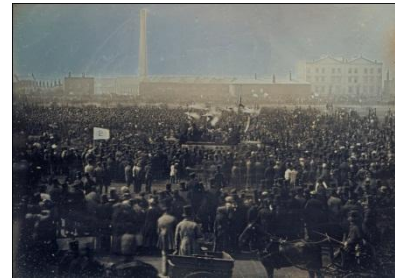
Kennington Common, Royal Collection Trust / © HM Queen Elizabeth II 2014

During 1848 the Chartists launched the third and final Chartist petition . Over 5 million signatures were said to have been collected, and at a mass meeting in Kennington Common, London on 10 April O'Connor addressed the crowd. However, the government was very nervous about this rally. Over 85,000 special constables and 8,000 troops were in place to meet between 20,000 and 50,000 Chartists . Fearful of the violence that could occur if the meeting marched to Parliament to present the petition, O'Connor convinced the crowd to let him deliver it instead. On doing so the petition was again rejected by Parliament.