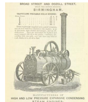
A new Steam Engine, 1857

In what historians call the ' Industrial Revolution ', new technologies were introduced into manufacturing. This meant that goods could be made in larger numbers and much more cheaply. It led to many major social changes. Many people moved from the countryside to new towns to work in the new factories. New 'classes' of people emerged – the wealthier middle classes, such as those who owned or managed the new factories, and the working classes who mostly worked in them. Generally, the people in these groups could not vote, and many felt that their interests were not represented in Parliament.