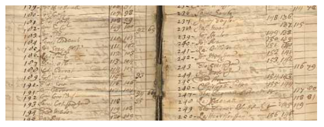
A 'poll book' from 1708

answer was written down and the lists – 'poll books' – could be bought from local